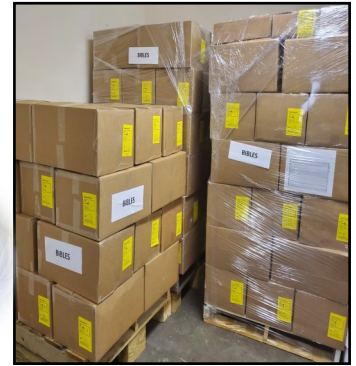
Bundled "Seed" Ready to Sow

Since the previous newsletter (Oct-Dec) we have been reminded of the scripture in 2 Corinthians 9:10, but also, Isaiah 55:11 "...my word shall not return to me void."