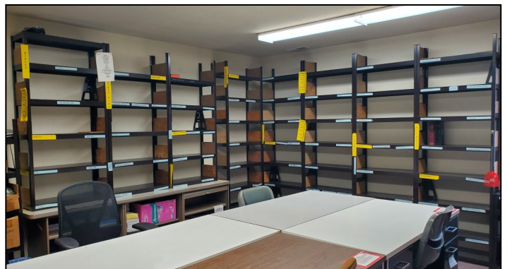
CLA Processing Room

If you know of a retiring pastor, a closed church library, please contact the CLA office.