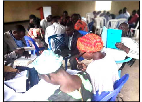
CLA Extension Education Class in Action

"I just want to Congratulate CLA Ministry (edited) as a foundation stone: it feeds people in Africa. It reaches many souls who hunger after God's word. We are hearing God's word and applying it. On behalf of Disciplers Bible Studies, We found the right pillar and corner stone. CLA is the right pillar and foundation stone; helping nonbelievers to unmask. CLA Ministry Center is the pillar of Disciplers Bible Studies Ministry in Kenya, East Africa, Helping people in Africa relate."