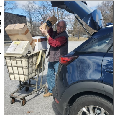
Shalleys Collecting Idaho Boxes from the Post Office