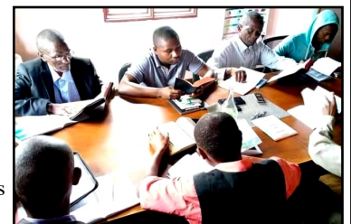
Kenya Extension Class

“...at church I shared and introduced CLA...There was immense gratitude and celebrations. I am foreseeing a greater harvest. I will be targeting church leaders and Bible College graduates...in this mission to expand the spread. Graduates are expected to use the CLA materials as an entry point for new churches.”