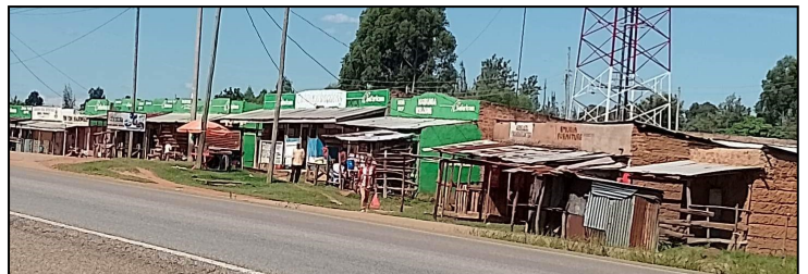
THE PRINT SHOP

My mission since I knew Ps and CLA family has been, "How can I expand this provision of literature for discipleship and inspiration to other segment of the Society...?" Based on the above challenges...I also intend to install a Christian library in the ministry from where all members will be able to access the Christian literature materials. The library will also be opened to the wider community... Finally, I appreciate God for this call and would be happy if CLA family can start supporting my ministry through supply of literature materials.