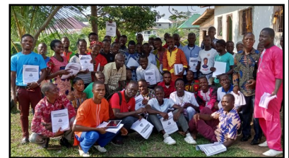
Liberia Discipleship Class

“I'm printing some materials for training on Saturday this week end. There will be 40 to 50 participants from different churches... These materials are very good for new and old believers in our various churches in Liberia.”