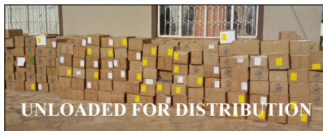
UNLOADED FOR DISTRIBUTION